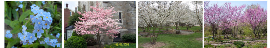
Brunnera macrophylla Cornus florida Amelanchier canadensis Cercis canadensis

The clients have gradually made the changes, taking their time and enjoying the process.