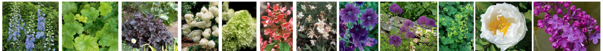
Delphinium Centurion 'Sky Blue' Heuchera Dolce 'Key Lime Pie' Heuchera 'Black Beauty' Hydrangea paniculata 'Little Lamb' Hydrangea paniculata 'Lime Light' Hydrangea macrophylla 'Endless Summer' Gaura Geranium Ibericum Allium Alchemilla mollis Paeonia suffruticosa Syringa